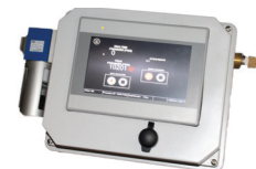
Pressure Data Logger